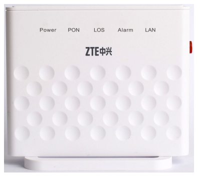
Table 3-1 describes the indicators on the front panel of the ZXHN F601 unit.